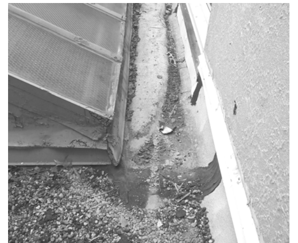
These photos show areas of weakness and places where leaking has been prevalent.

Continue to pray for our faith family, the safety of the workers, and our ministry for God in this community.